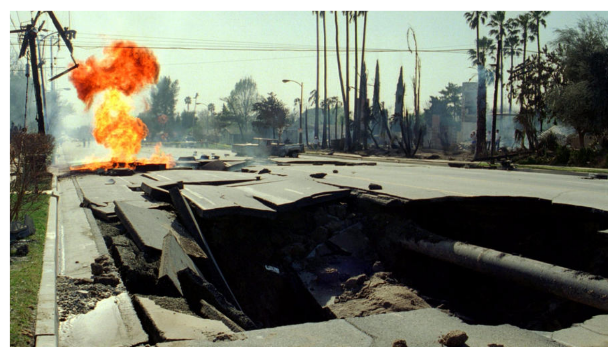
Ruptured gas mains burn behind a giant crater in the 11600 block of Balboa Boulevard in Granada Hills on Jan. 17, 1994, after the Northridge earthquake. Several homes burned near where the gas line exploded.